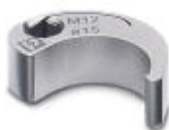
Nut for assembling M12 connectors for assembly with a knurl diameter of 20 mm, for 4 mm hexagonal drive