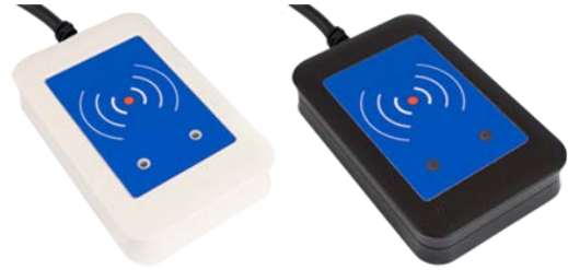
Desktop version (inlay customizable)

Elatec's TWN4 family of transponder readers and writers allows users to read and write to almost any 125 kHz, 134.2 kHz and 13.56 MHz tags and/or labels. It supports all major transponders from various suppliers like ATMEL, EM, ST, NXP, TI, HID, LEGIC, etc. and ISO standards like ISO14443A/B (T=CL), ISO15693, ISO18092 / ECMA-340 (NFC).