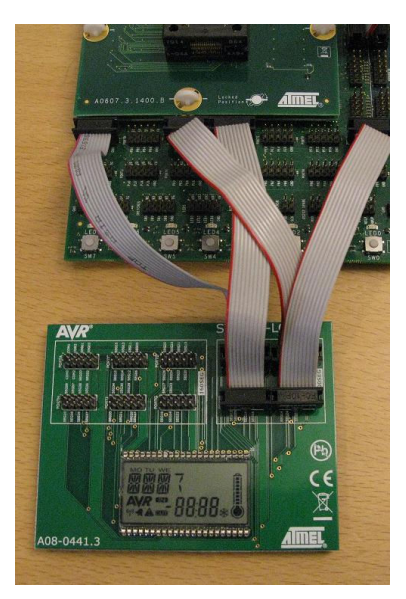
b) 100 segments mode