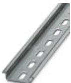
DIN rail, material: Galvanized, perforated, height 7.5 mm, width 35 mm, length: 2 m

DIN rail perforated - NS 35/ 7,5 ZN PERF 2000MM - 1206421