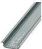
DIN rail 35 mm (NS 35)

DIN rail - NS 35/ 7,5 WH UNPERF 2000MM - 1204122