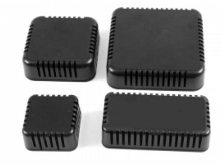
Available in four sizes.