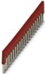
Plug-in bridge, pitch: 6.2 mm, width: 122.3 mm, number of positions: 20, color: red

Please be informed that the data shown in this PDF Document is generated from our Online Catalog. Please find the complete data in the user's documentation. Our General Terms of Use for Downloads are valid ( http://phoenixcontact.com/download )