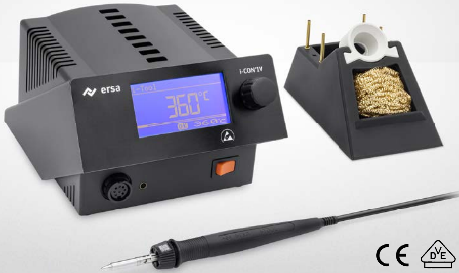
i-CON 1V MK2 with i-TOOL MK2