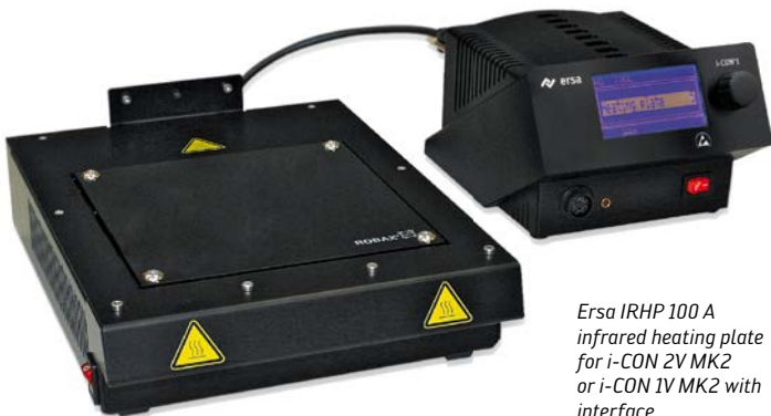
Ersa IRHP 100 A infrared heating plate for i-CON 2V MK2 or i-CON 1V MK2 with interface.