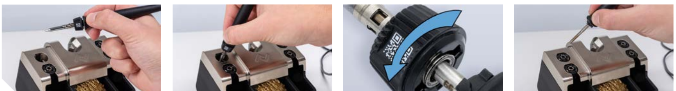
Super fast tip change: by hand or using the 0A58 tool holder which is compatible with i-TOOL TRACE and all i-TOOL MK2 series soldering irons (option).