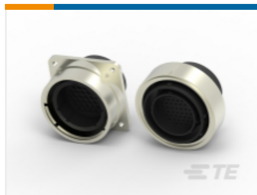
TE Part # CAT-AM71-C83998C Circular Plastic Connector, CMC Series 1