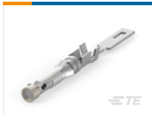
TE Part # 202237-5 III+ SOC,SOLTAB,TIN,LP