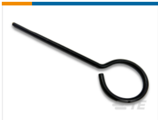
TE Part # 200893-2 INSERTION TOOL CONT