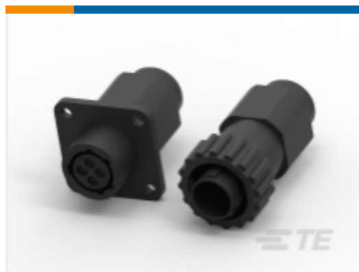
TE Part # CAT-AM71-C83998Y One-Piece Connector, Sealed, CPC Series 1