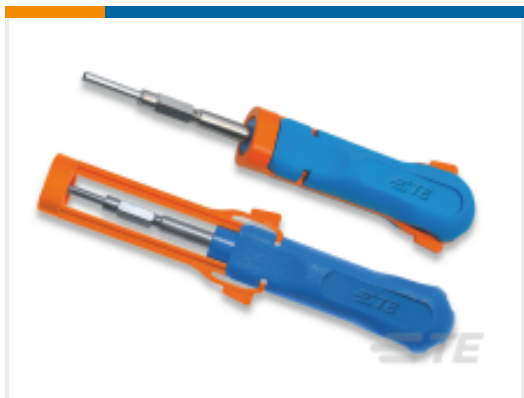
TE Part # 539972-1 EXTRACTION TOOL