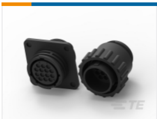
TE Part # CAT-AM71-C83998K Circular Connector, Environmentally Sealed, CPC Series 6