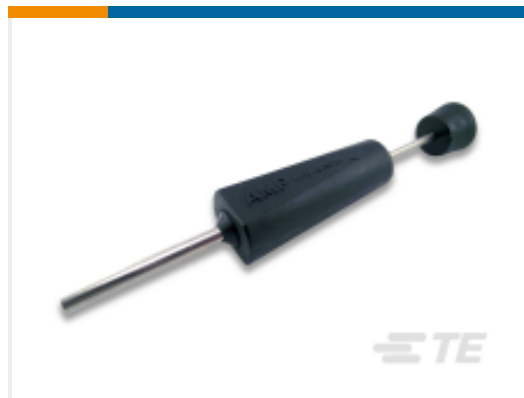
TE Part # 305183 EXTRACT TOOL TYPE 2 20-16