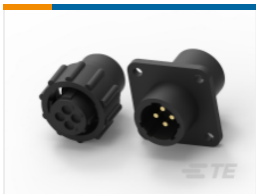
TE Part # CAT-AM71-C83998J Cable/Panel Mount Connector, CPC Series 1