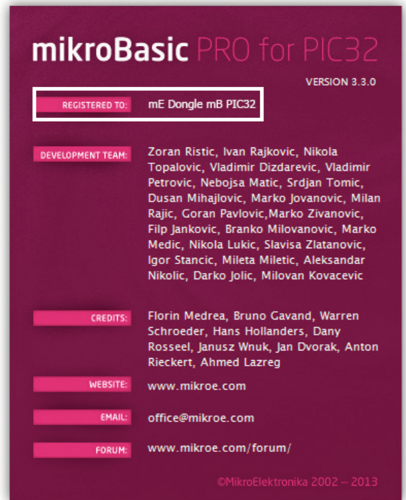
Figure 1-2: mikroBasic PRO for PIC32® About Window