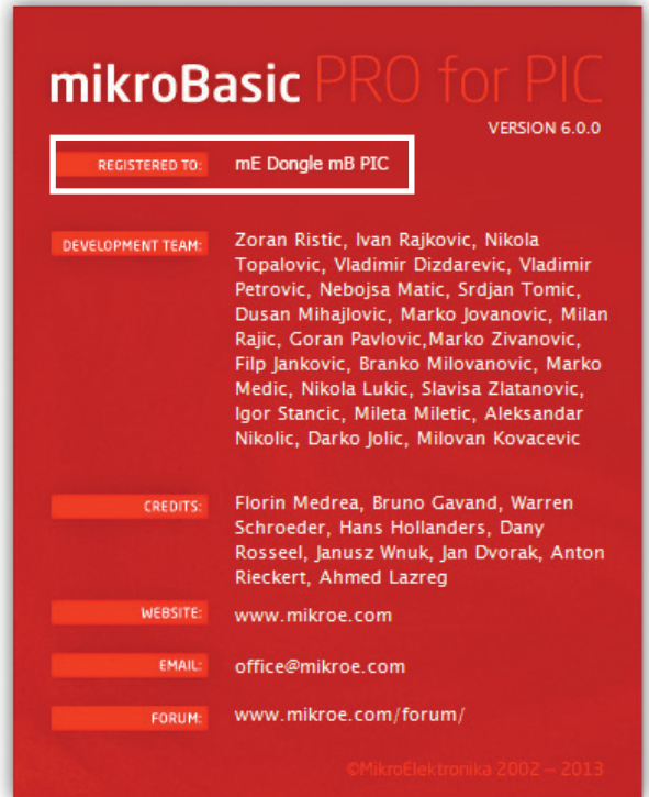
Figure 1-2: mikroBasic PRO for PIC® About Window