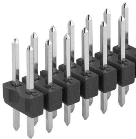
PCB connectors>Male headers two rows, \square 0.635 mm