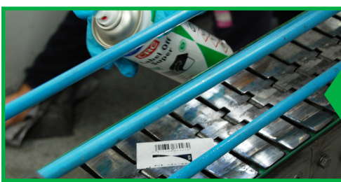
REMOVE LABEL FROM THE PROCESSING LINE