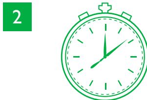
2 SOAK FOR 1-2 MIN