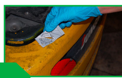
TO REMOVE PLASTICIZED LABELS SCRATCH SPRAY WAIT PEEL