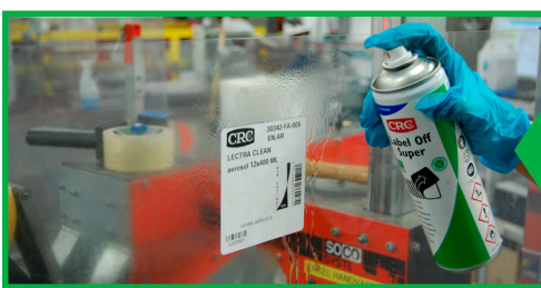
REMOVE LABEL FROM GLASS