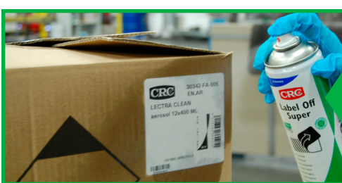
REMOVE LABEL FROM CARDBOARD