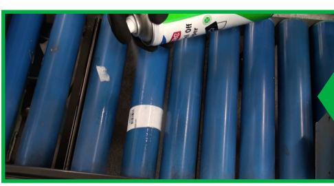
REMOVE LABEL FROM PLASTIC