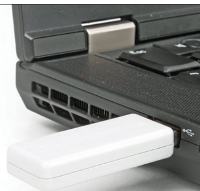
Figure 1-3: USB Dongle plugged into Laptop USB host connector

Unfortunately not. If you lose your dongle you will need to buy a new compiler license and pay the full price.