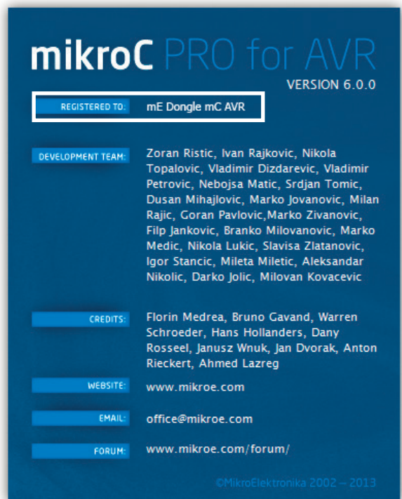
Figure 1-2: mikroC PRO for AVR® About Window