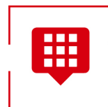
10 types of battery standards