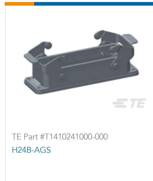
TE Part #T1410241000-000 H24B-AGS