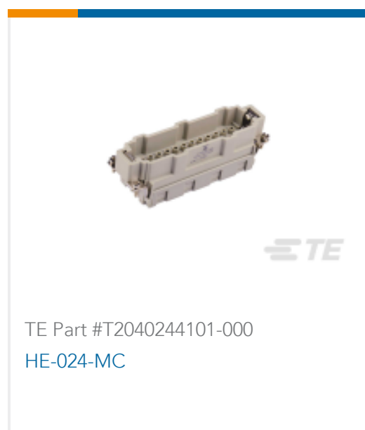
TE Part #T2040244101-000 HE-024-MC