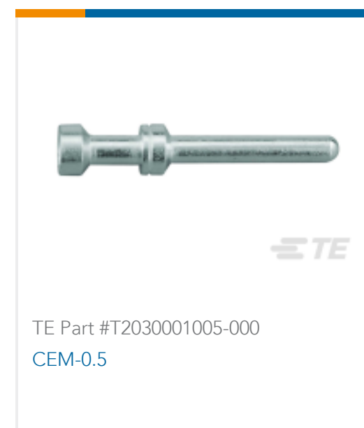
TE Part #T2030001005-000 CEM-0.5