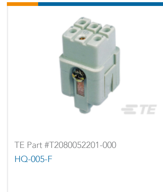
TE Part #T2080052201-000 HQ-005-F