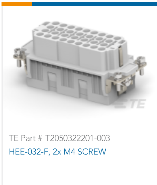
TE Part # T2050322201-003 HEE-032-F, 2x M4 SCREW