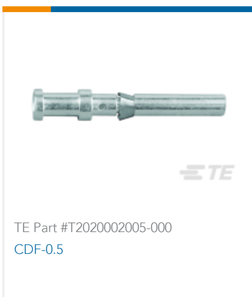
TE Part #T2020002005-000 CDF-0.5