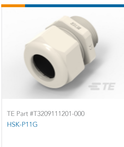
TE Part #T3209111201-000 HSK-P11G