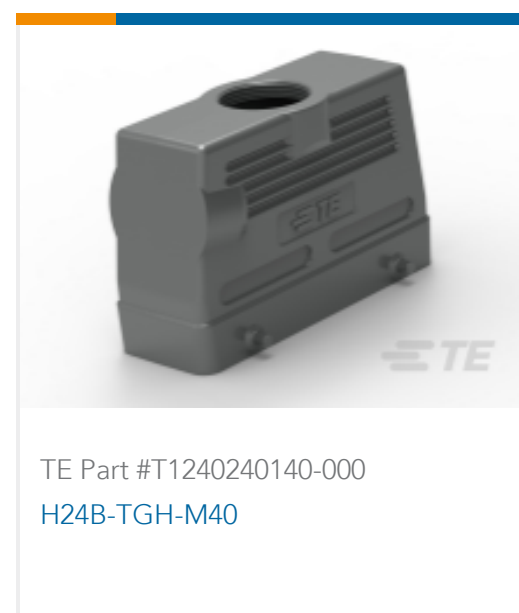
TE Part #T1240240140-000 H24B-TGH-M40