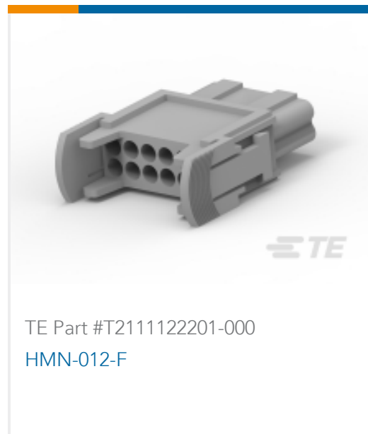
TE Part #T2111122201-000 HMN-012-F