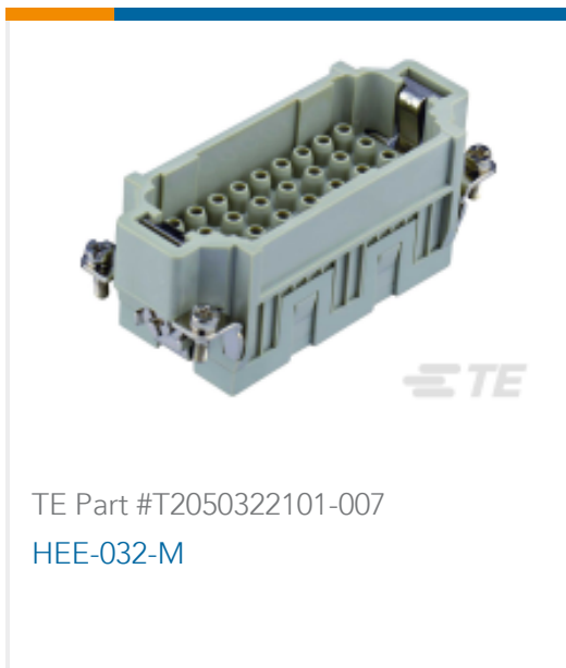
TE Part #T2050322101-007 HEE-032-M