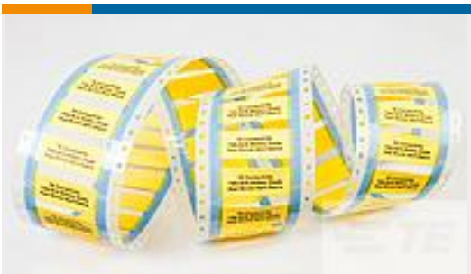
TE Part #5006530001 TMS-SCE-1K-3/4-2.0-8