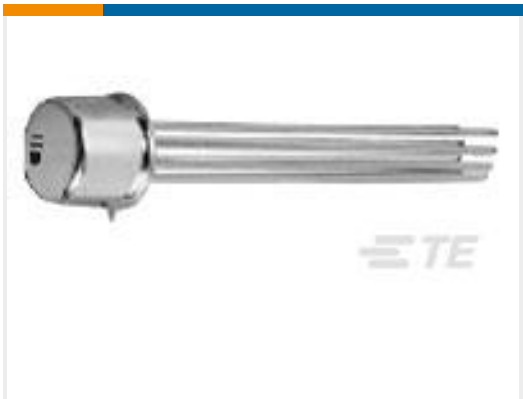
TE Part #1617168-9 JMSCT-26XLS = M28776/3-046L