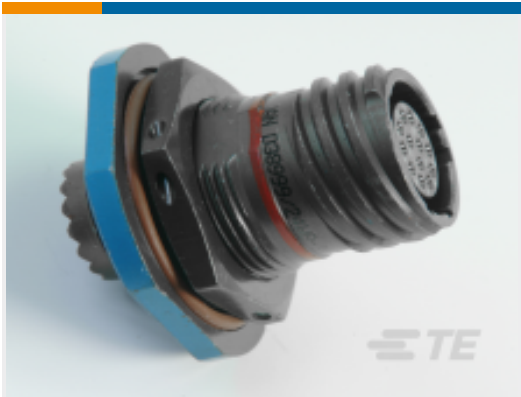
TE Part #YDTS24W25-29SCV001 Jam Nut: D38999, 25-29 Insert