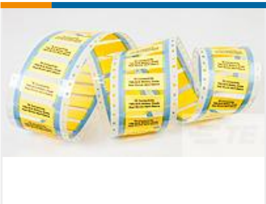
TE Part #215926-000 TMS-SCE-1K-1/8-2.0-6