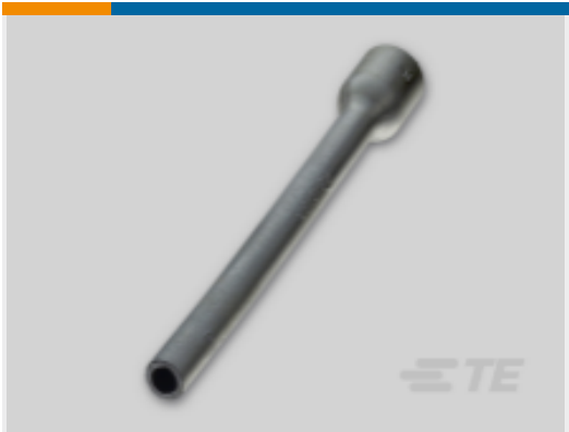
TE Part #424246-000 Low Profile HS Boots: Blow Molded, Slim Line, Lipped, Straight