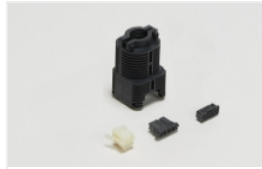
Rectangular Connector Housings(1)