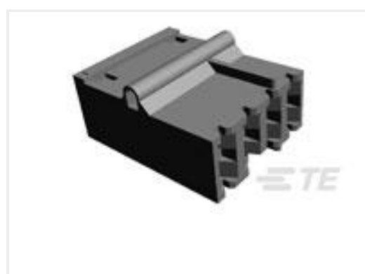
TE Part #928343-2 STD-TIM GEH 2P