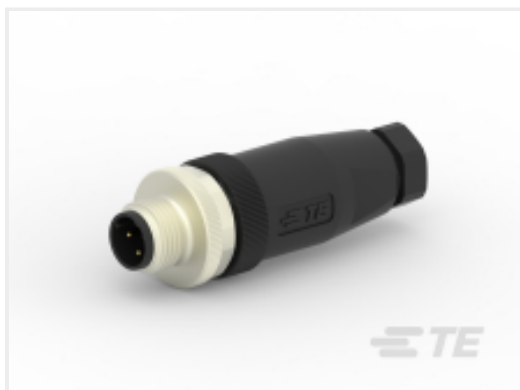
TE Part #T4111501041-000 M12,MALE,STRAIGHT,D CODE,4P, PG7,GOLD