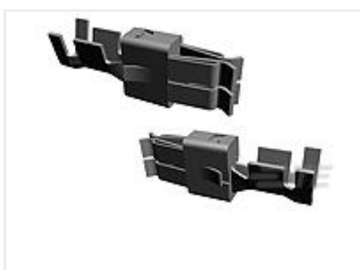
TE Part #964204-1 STD-POW-TIM KONTRAKT