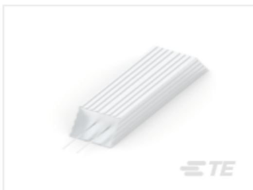
TE Part #2176508-8 CJP 300W 2R2 5% Lead