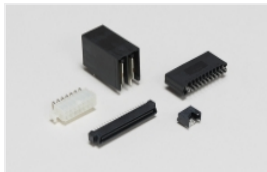
Standard Rectangular Connectors(63)