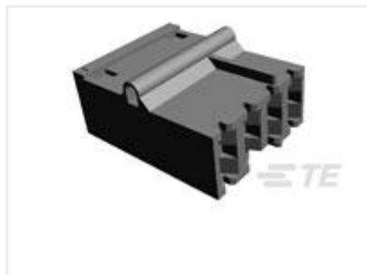
TE Part #928343-4 STD TIMER GEH 4P