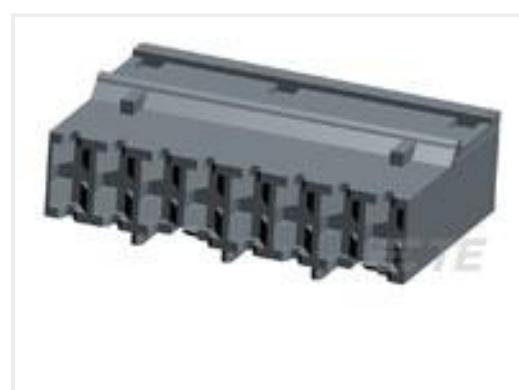
TE Part #928343-8 STD-TIMER GEH 8P