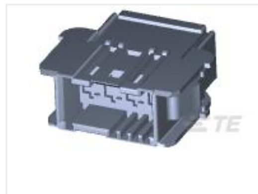
TE Part #293009-1 4 POS. FASTIN-FASTON CONN. TAB HOUSING R