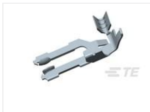
TE Part #926770-1 MT.EDGE CRIMP CONT.