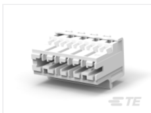
TE Part #1703104-1 5 POS MT - EDGE HOUSING