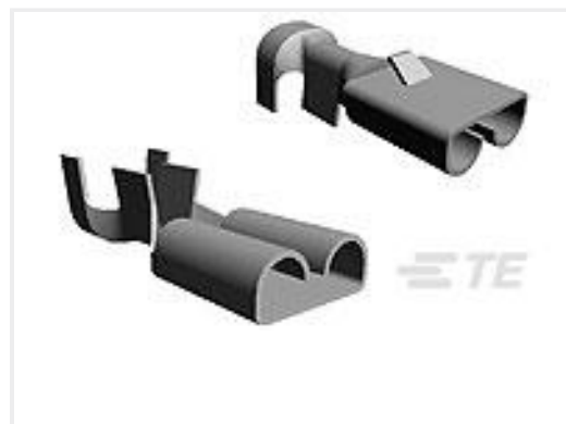
TE Part #60413-1 FF 250 REC 22-18AWG TPBR