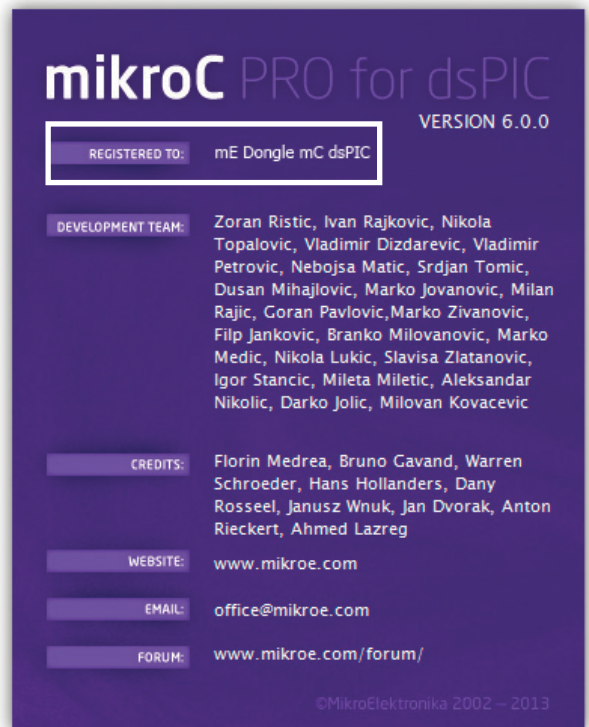
Figure 1-2: mikroC PRO for dsPIC® About Window