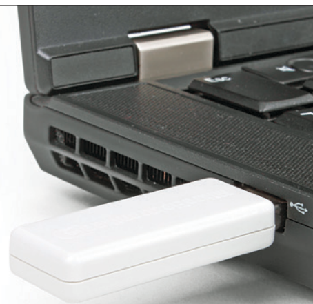
Figure 1-3: USB Dongle plugged into Laptop USB host connector

Unfortunately not. If you lose your dongle you will need to buy a new compiler license and pay the full price.