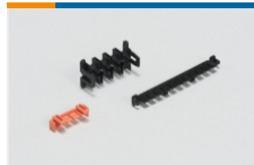
Rectangular Connector Locking(4)