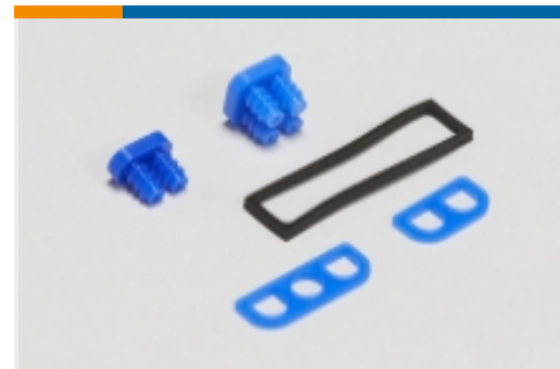
Rectangular Connector Seals(26)