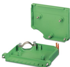
Cable housing, product range: KGS-PC 4/..-F

Please be informed that the data shown in this PDF document is generated from our online catalog. Please find the complete data in the user documentation. Our general terms of use for downloads are valid.