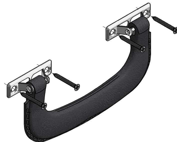
EXPLODED ISOMETRIC VIEW