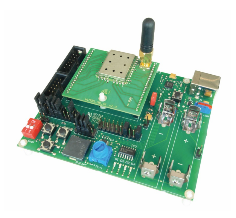
Figure 1: WiMOD iM282A and Demo Board