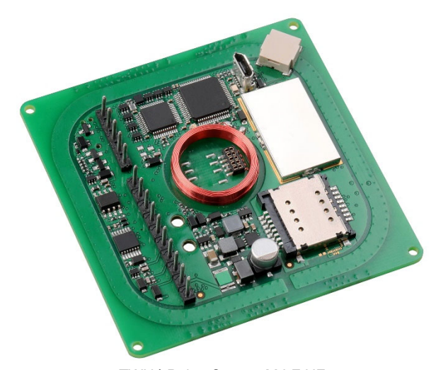
TWN4 Palon Square M LF HF PCB component side (exemplary illustration)

TWN4 Palon Square M LF HF is a versatile OEM PCB for integration into third-party products and devices. It supports enhanced interfaces, especially RS-485. The new single PCB module inherits all advantages and tool support of the ELATEC TWN4 family. Although being a general-purpose PCB module, it is optimized for time attendance and access control.