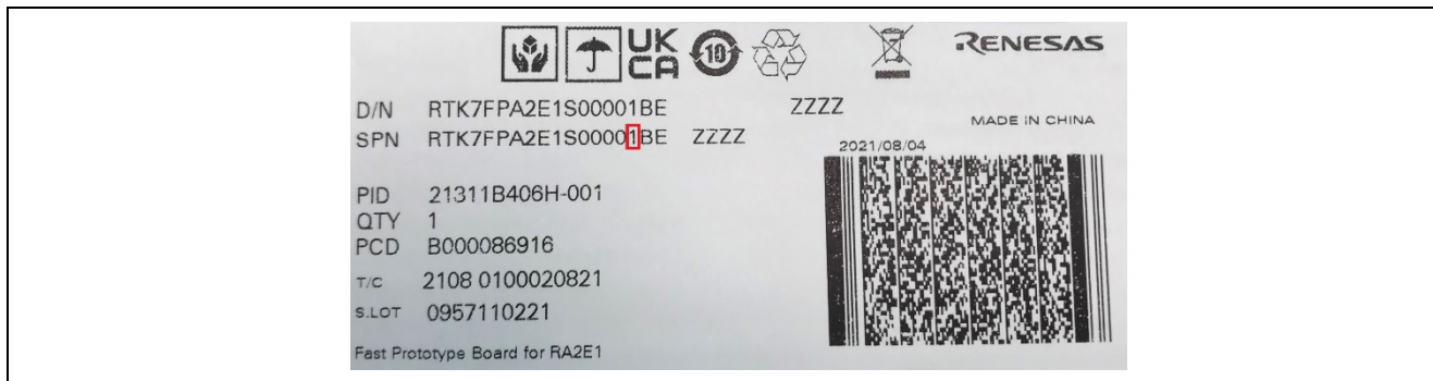
Figure 2. Identification of the Kit Version Number on the FPB-RA2E1 Kit Packaging

The kit version can be found on the FPB-RA2E1 kit packaging label as described in this section. The kit version is the last digit in the orderable part number as shown in Figure 2. In the following example the kit version number is “1”.