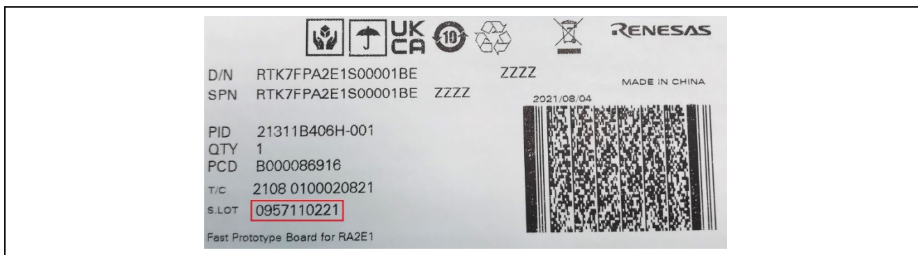
Figure 3. Identification of the Serial Number on the FPB-RA2E1 Kit Packaging

The serial number is located on the packaging label identified as S.LOT and on the serial number sticker on the back/bottom side of FPB-RA2E1 board. In the example in Figure 3 and Figure 4, the serial number is “0957110221.”