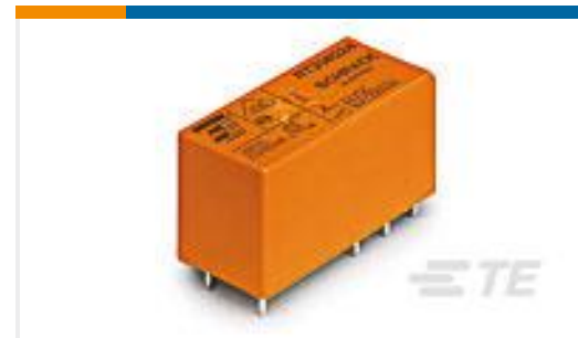
TE Part #7-1393239-2 RT31L006