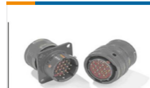
TE Part #ZPF000000000006408 951-02H 8-4 P 50 B823