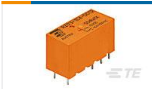
TE Part #5-1415899-5 RZ03-1C3-D024