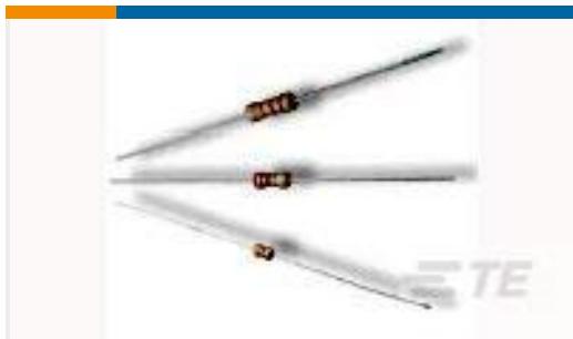
TE Part #2-1623930-9 CFR25 5% 1K0