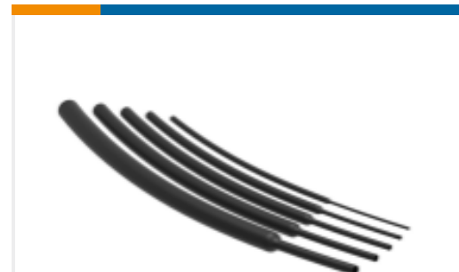
TE Part #NB16934001 VERSAFIT-3/64-0-SP