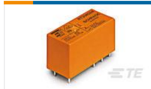
TE Part #7-1393239-5 RT31L024