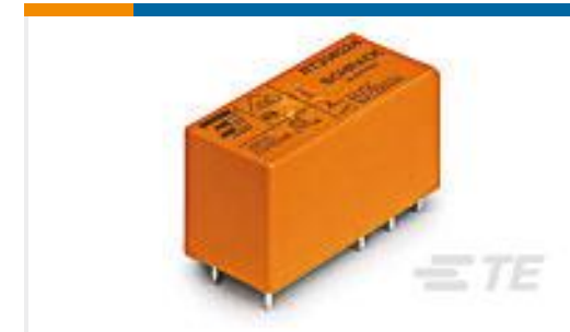
TE Part #7-1393239-3 RT31L012