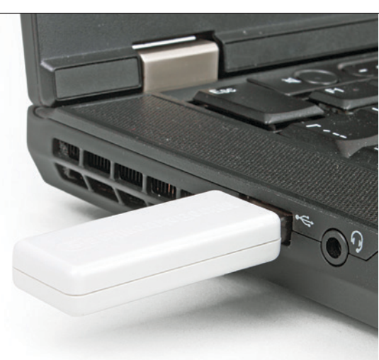
Figure 1-3: USB Dongle plugged into Laptop USB host connector

Unfortunately not. If you loose your dongle you will need to buy a new compiler license and pay the full price.