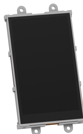
The uLCD-32W-PTU Display Module