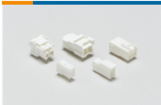
Rectangular Power Connectors(712)