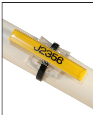
PP-profile + a PTM10 sleeve, mounted on a cabler.