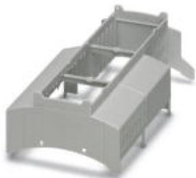
Installation component housing, Upper part, Color: light gray, Width: 161.6 mm, Constructional height: 62.2 mm

Please be informed that the data shown in this PDF Document is generated from our Online Catalog. Please find the complete data in the user's documentation. Our General Terms of Use for Downloads are valid ( http://phoenixcontact.com/download )