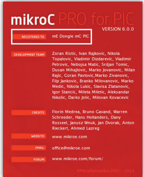
Figure 1-2: mikroC PRO for PIC® About Window