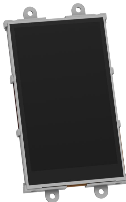
The uLCD-32W-PTU Display Module