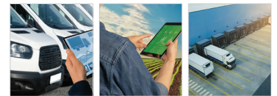
Asset & Workforce Tracking